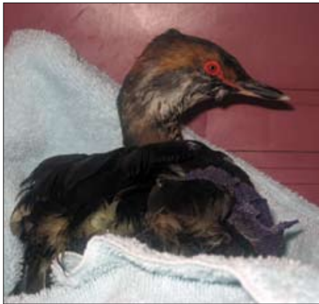
Top to bottom An injured rail, a flying squirrel, an injured horned grebe at the Carolina Wildlife Center